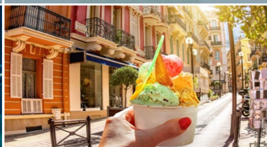
Enjoy an ice cream at Pierre Geronimi