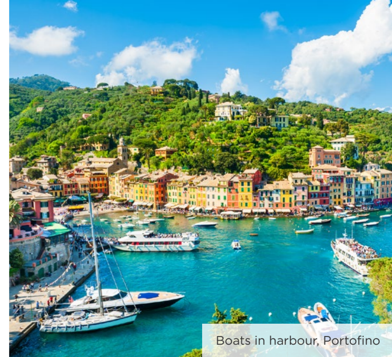
Boats in harbour, Portofino