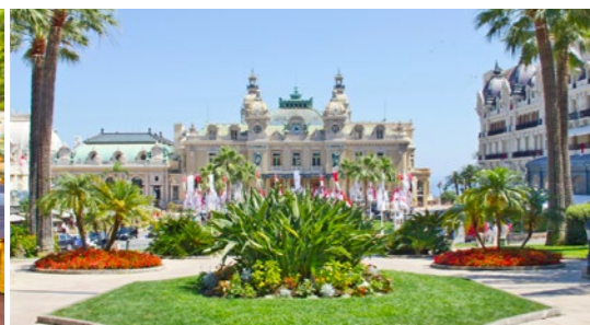
Place your bets at the Casino de Monte Carlo