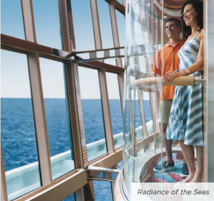
Radiance of the Seas