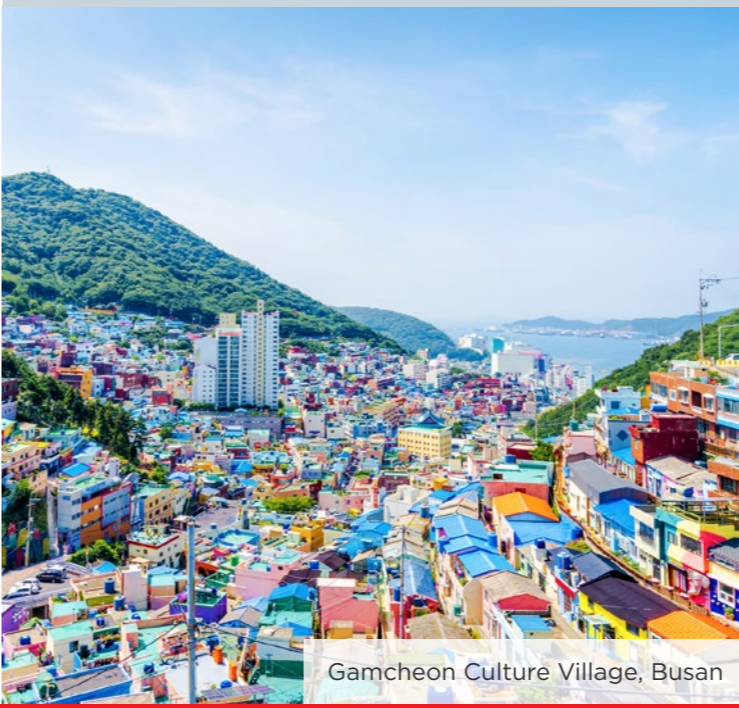
Gamcheon Culture Village, Busan