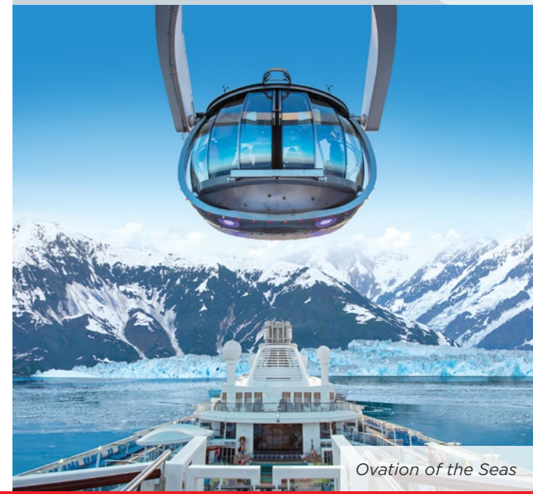
Ovation of the Seas