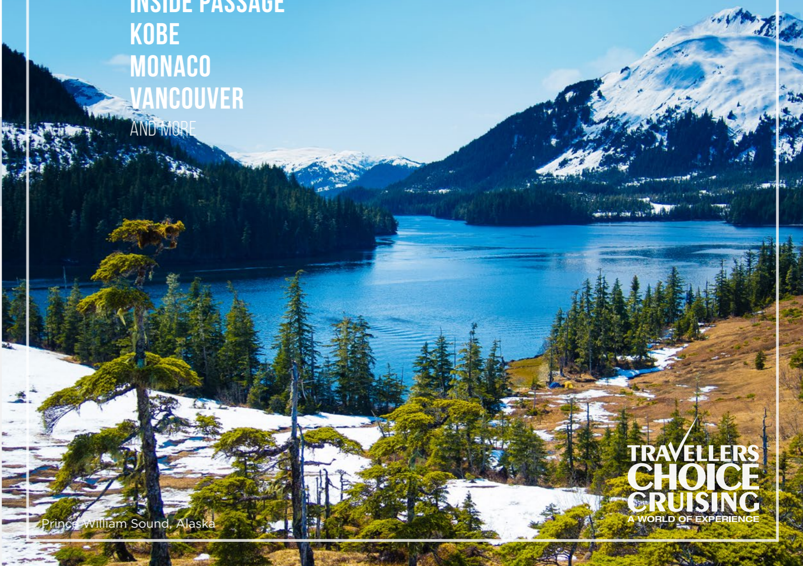
Prince William Sound, Alaska

TRAVELLERS CHOICE CRUISING A WORLD OF EXPERIENCE