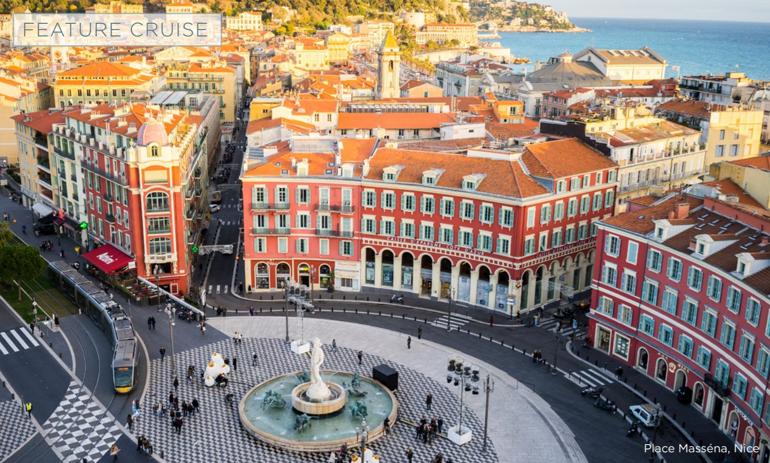
Place Masséna, Nice