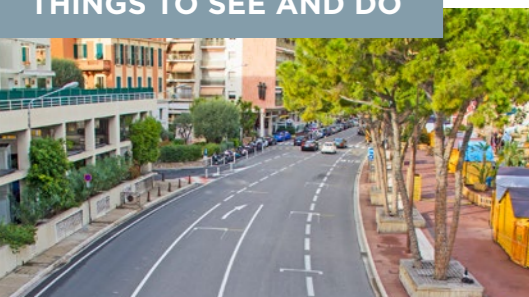
Witness the spectacular Formula One Grand Prix